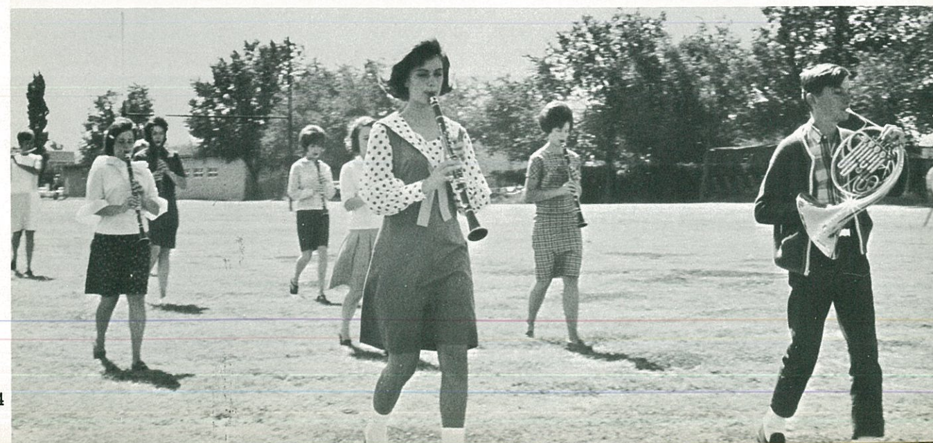
The K-Band practices a new routine for a football game.