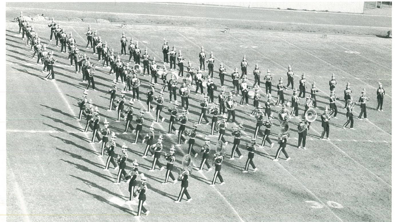
The Kermit High School Band marches at the UIL contest in Big Spring.